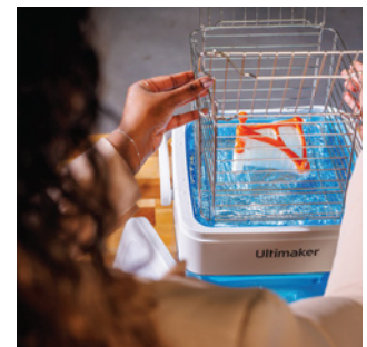
PVA Removal Station Remove water-soluble PVA support material up to 4X faster