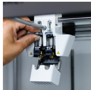
Print core CC Ruby-tipped for printing abrasive glass and carbon fiber composites. Available in 0.4 and 0.6 mm