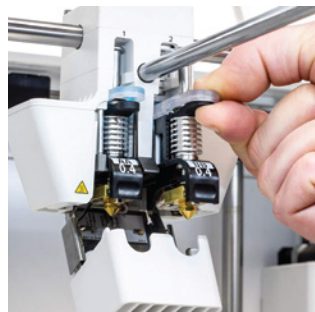
Print core BB Quick-swap nozzles for build and water-soluble support materials. Available in 0.25, 0.4, and 0.8 mm